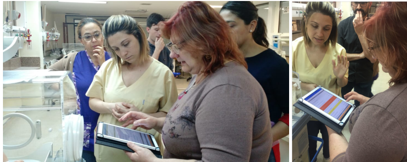
Fig. 5. Nurses from the neonatal service of Hospital Penna performing a live test of the SIMONE system, without any prior explanation. At the end of the test, nurses and hospital staff were satisfied.

The integration of SIMONE to the care practice would contribute to standardize the attention processes and increase the motivation of people to participate. In turn, the interesting thing about this initiative is that SIMONE would not remain in isolation, but within the framework of a set of security interventions that would link the results of one intervention with another. In this regard, we hope to be able to integrate SIMONE with new procedures that allow its application in different areas of the hospital.